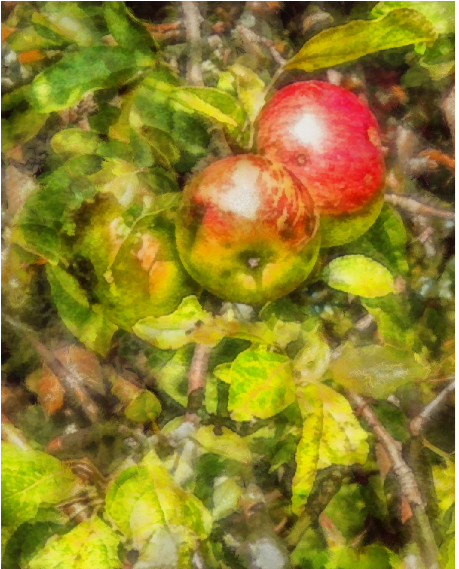
September Apples by Don Berg